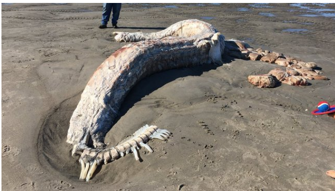
Mystery creature washes up on Scarborough beach (/news/local/gallery/mystery-creature-washes-up-on-scarborough-beach)