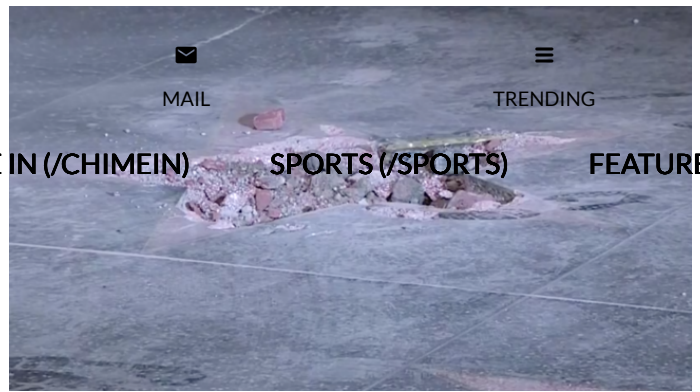
Donald Trump's star vandalized on the Hollywood Walk of Fame (/news/nation-world/gallery/donald-trumps-star-destroyed-on-the-hollywood-walk-of-fame)