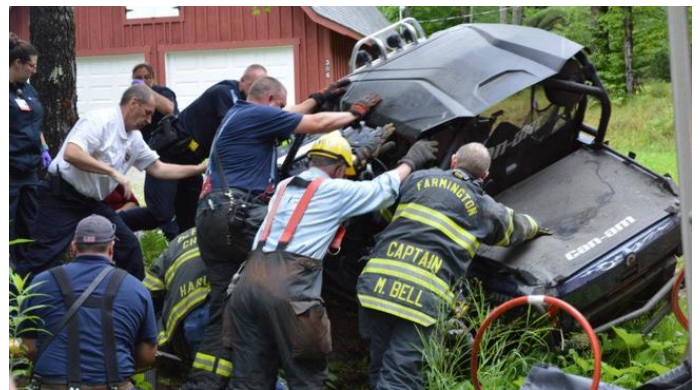
Two girls injured in Farmington ATV crash (/news/local/gallery/two-girls-injured-in-farmington-atv-crash)