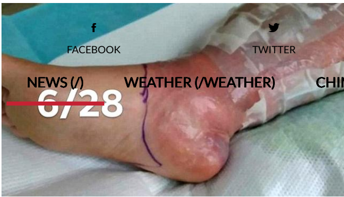
Woman almost loses leg after infection, disease blamed on pedicure (/news/nation-world/gallery/woman-almost-loses-leg-after-disease-blamed-on-pedicure)